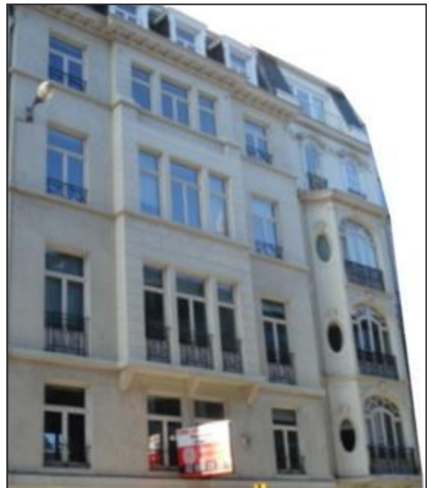
Future UEMS Office: Rue de l’Industrie, 24

As already stated: These new premises, located 24 Rue de l’Industrie at BE-1040 Brussels, were selected not only for their excellent location at the heart of the “European Quarter” but also for their large office space and good state. Now that this building is eventually its property, the UEMS is happy to invite other medical organisations under that roof and thereby make it the much awaited DOMUS MEDICA EUROPEA .