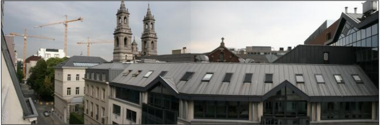
A view from the Domus Medica Europea: Square Frère Orban & Rue de l'Industrie

Located at the very Heart of Brussels' European Headquarters Area, the future "Domus Medica Europea" will pave the way for a strong representation of European doctors to the EU Institutions.