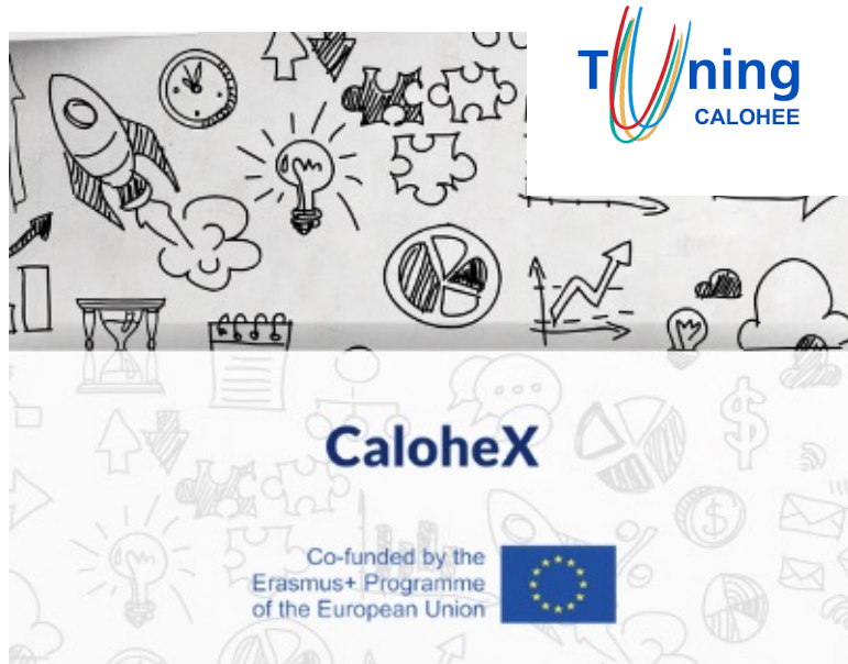
Measuring and Comparing Achievements of Learning Outcomes in Higher Education Extension (CALOHEX)